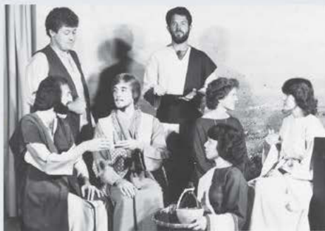
1981-82 HIS Company traveling drama troupe

Go to this link: http://fw.taylor.edu/news/his-company-reunion-scheduled-for-homecoming-2015 to see pictures and to read some of the reflections of HIS Company members.